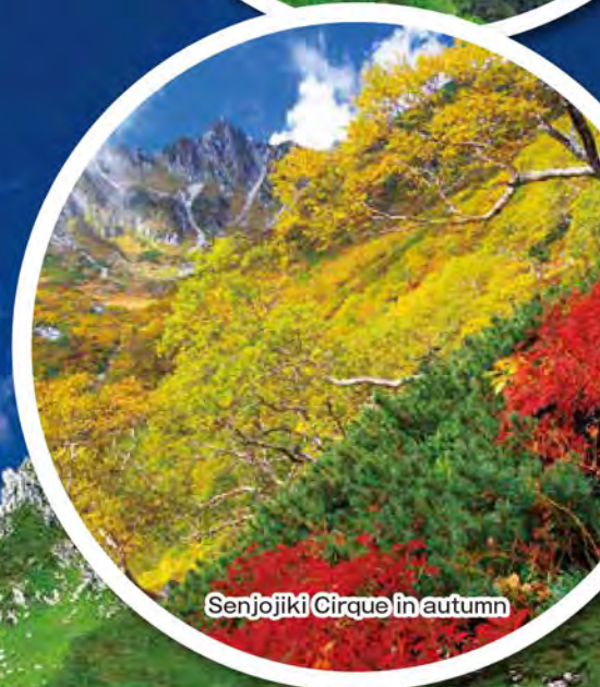
Senjojiki Cirque in autumn