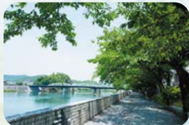
Kiso River promenade