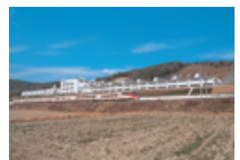
Environmental conservation activities under ISO 14001(Maigi Inspection Yard)