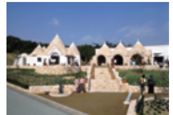
The Little World Museum of Man