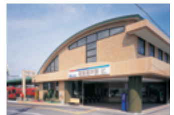
Environmentally friendly model railway lines and stations

The promotion of environmentally friendly corporate activities carried out as part of our management strategy represents another way in which we seek to become a “top name in reliability.”