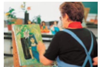
The life solutions operations let people lead fuller lives