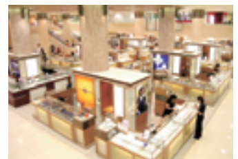
Revitalizing a station and the surrounding area fosters urban redevelopment