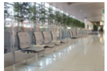
Promotion of total recycling of resources