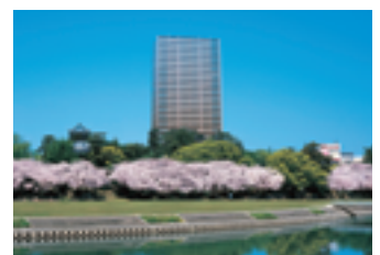
Our development operations contribute to the creation of suburban communities