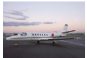
Air transport operations meet a variety of needs