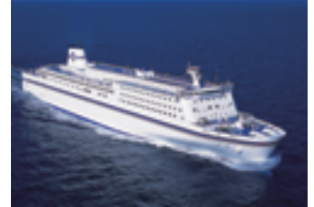
Comfortable and enjoyable maritime transportation