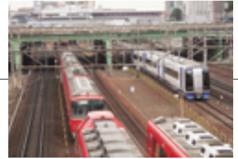
Safe, precise, and comfortable land transportation

In the future, we will continue to upgrade our transportation services while fostering closer ties among our group companies and collaborating with other operators to build stronger transportation networks that make use of local strengths. Through these operations, we will seek to enhance customer satisfaction and contribute to the community.