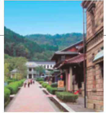
The Museum Meiji-Mura

The Meitetsu group also operates Meitetsu Hospital and provides nursing care and aid services for the elderly and people with disabilities through its life support operations.